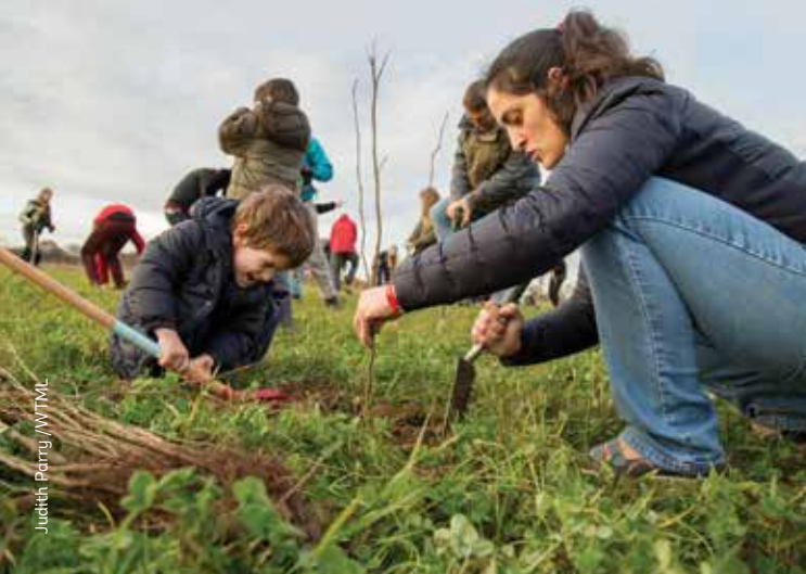
Judith Parry /WTML

Follow the self-guided waymarked trail from the car park to the site of the final tree (approx. 15min walk).